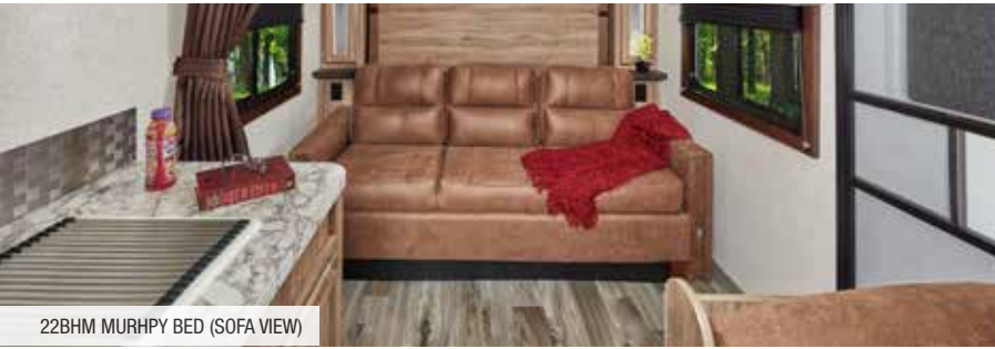
22BHM MURPHY BED (SOFA VIEW)