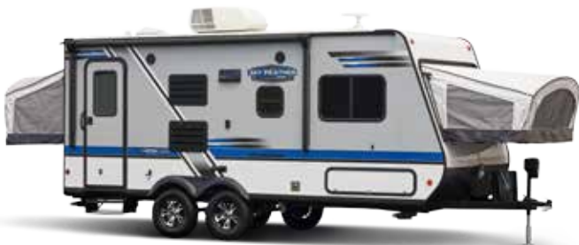
Jay Feather 7: Page 4