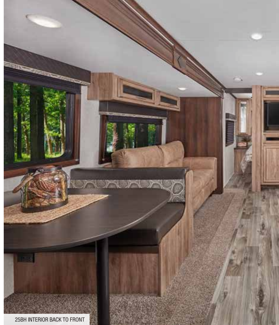
25BH INTERIOR BACK TO FRONT