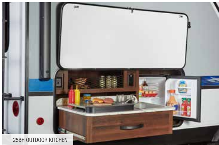
25BH OUTDOOR KITCHEN