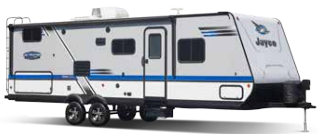
Jay Feather: Page 5