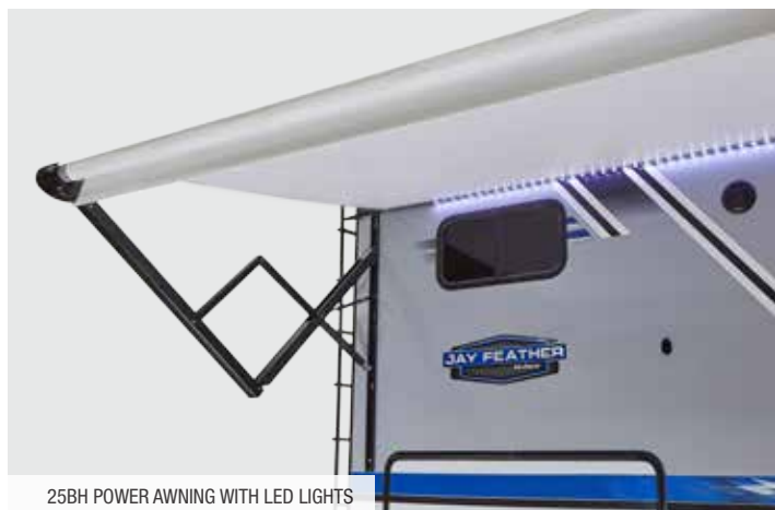
25BH POWER AWNING WITH LED LIGHTS