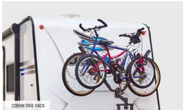
22BHM BIKE RACK