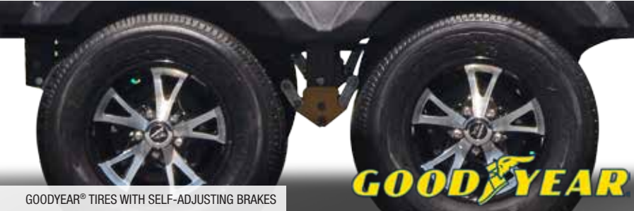
GOODYEAR® TIRES WITH SELF-ADJUSTING BRAKES