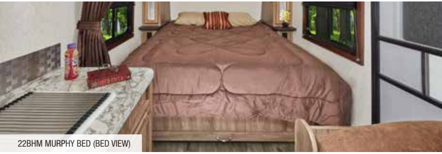
22BHM MURPHY BED (BED VIEW)